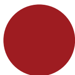
Candy Apple Red