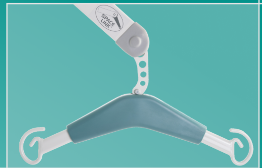
Standard Yoke - SY02

Useful for: All day-to-day patient lifting