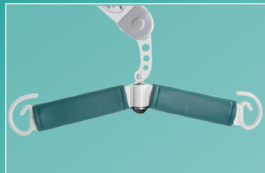
Hi-Lift Yoke - SY02HL