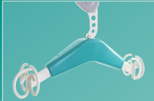
Tri Hook Yoke - SY03

Useful for: Facilities which have historically trained with this configuration