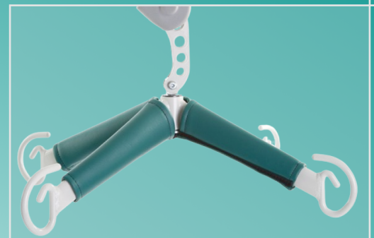
4 Point Yoke - SY04

Useful for: Supine lifting devices eg. Jordan frame