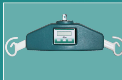
Standard Yoke with Integrated Weigh Scale - 2211037