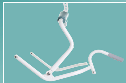
Pivot Frame - 2211038