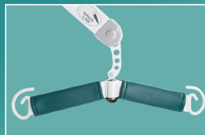
Hi Lift Yoke - 2211032