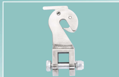
Quick Release Adapter - 2911039