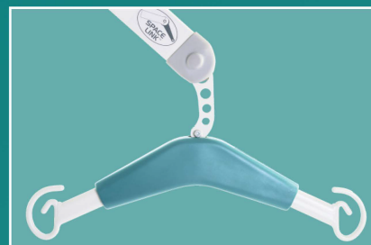
Standard Yoke - 2211030