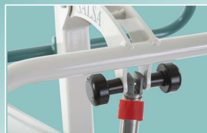
Knob Kit for Custom Sitting Sling - 2211085

The Allegro Concepts range of patient lifting equipment including lifters, slings and accessories has been designed and tested to comply with: AS ISO 10535-2011 Hoists for the transfer of disabled persons – Requirements and test methods.