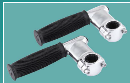
Tempo Handle Kit - 2211089