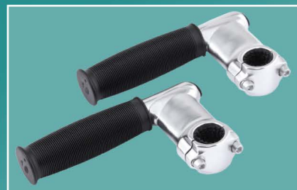
Tempo Handle Kit - THK01