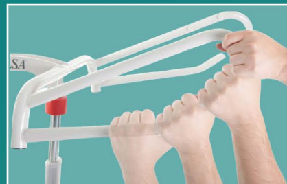
Multiple Grip Positions