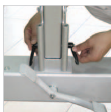
Quick release folding mast