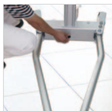
Retractable base width for storage