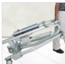
Neos shown folded for ease of storage and transfer