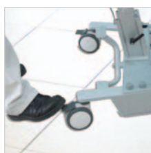
Rear castors with brakes for security