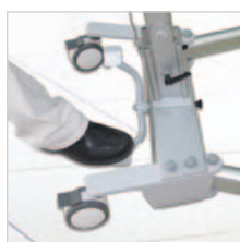
Simple adjustment of base width with foot pedal