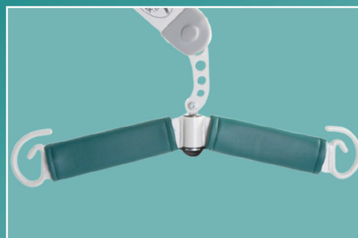
Hi-Lift Yoke - 2211032

Useful for: Reducing the loss of lifting height when installing an Allegro Universal Weighing Device