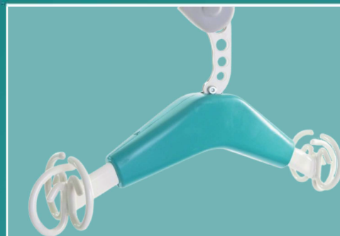
Tri Hook Yoke - 2211034

Useful for: Facilities which have historically trained with this configuration