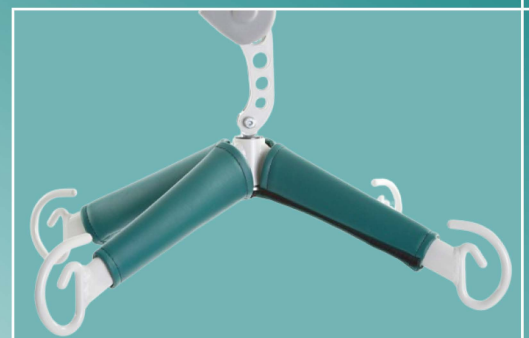
Power Pivot Frame - PPF01

Useful for: Supine lifting devices eg. Jordan frame