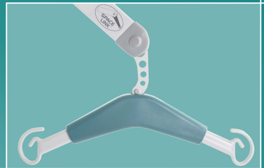
Standard Yoke - SY02

Useful for: All day-to-day patient lifting