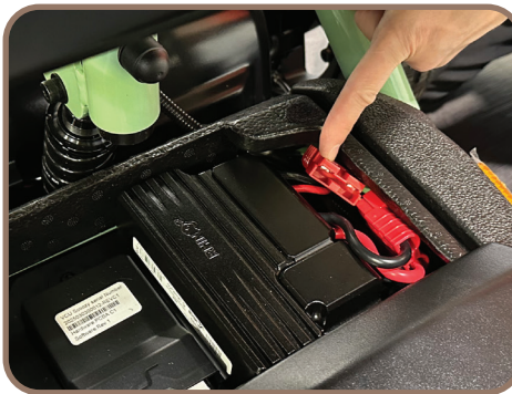
Locate the red anderson plugs