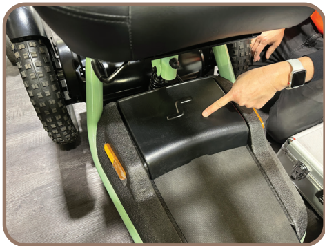
Remove the rear floor panel