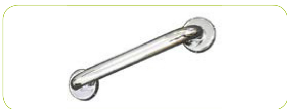
3. Hand Rail