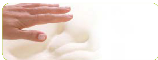
7. Pressure Prevention Seating / Overlay