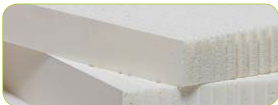
4. Latex Seating