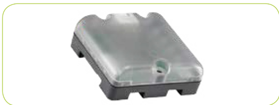
8. LCD Down Light