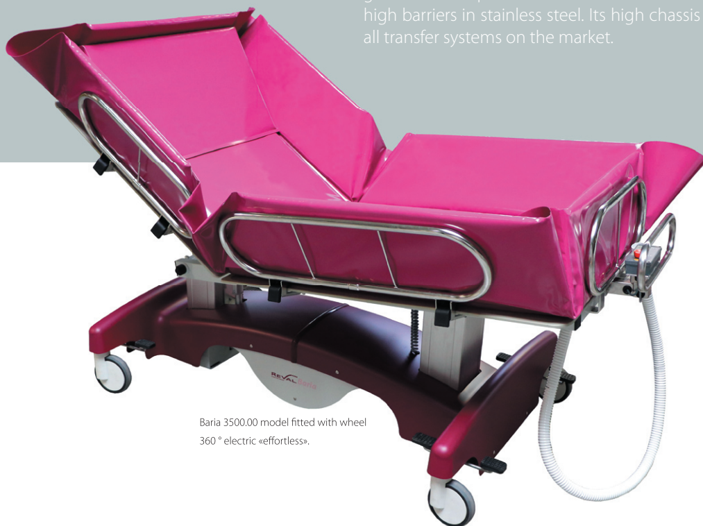
Baria 3500.00 model fitted with wheel 360 ° electric «effortless».