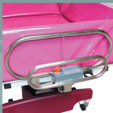
Sensitive push handle