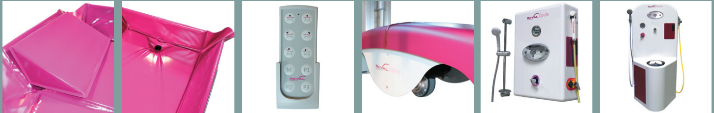
Wireless remote control option