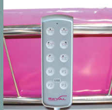
10 functions hand control