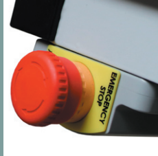
Emergency stop device