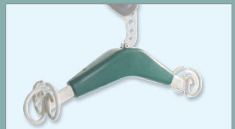
Tri Hook Yoke