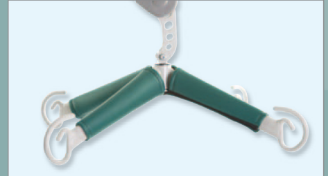
4 Point Yoke