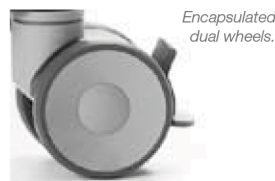
Encapsulated dual wheels.

The ergonomic handle is height-adjustable to enable the caregiver to work more conveniently, comfortably and in an ergonomically correct manner that prevents occupational injuries and minimizes discomfort for those who already have an injury. The smooth surface of the handle is easy to keep clean.