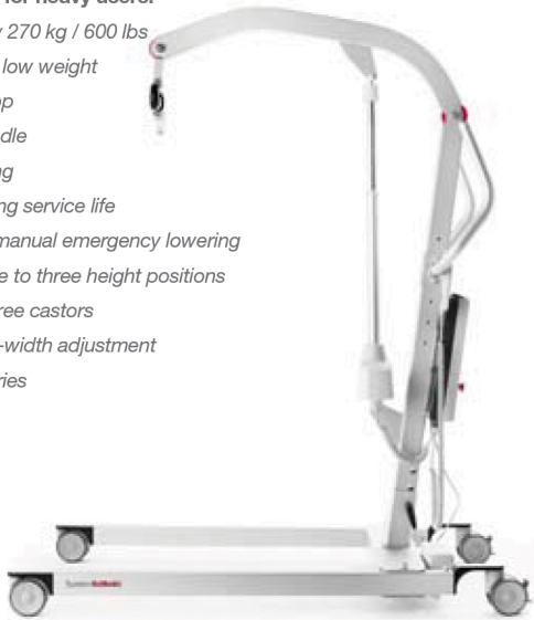
Eva600EE complies with requirements for Class 1-products in the European Medical Device Directive MDD/92/43/EEC.