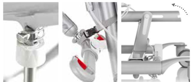
Using a quick-connecting locking pin, the actuator is released from the lift arm.

The lift can be used in all situations, and, when needed elsewhere, it is easy to move between different users, rooms and homes. The lift is delivered folded.