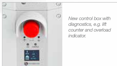
New control box with diagnostics, e.g. lift counter and overload indicator.