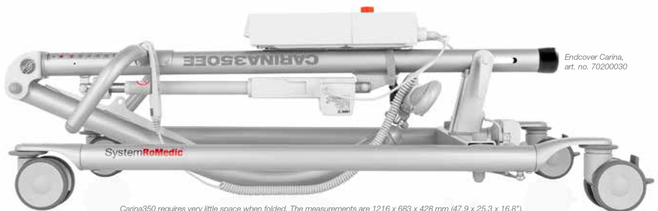
Endcover Carina, art. no. 70200030