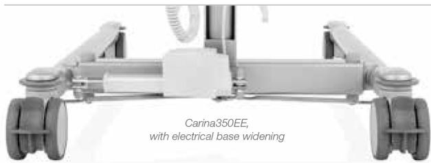
Carina350EE, with electrical base widening