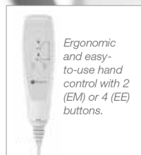
Ergonomic and easy-to-use hand control with 2 (EM) or 4 (EE) buttons.