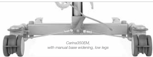
Carina350EM, with manual base widening, low legs