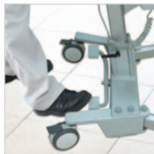
Simple adjustment of base width with foot pedal