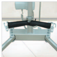
Extra low 34cm lifting height to allow floor lifts