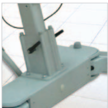
Quick release mast