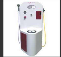
Shower and sluice system