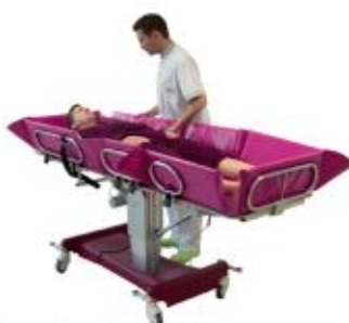
Iris shown in supine position