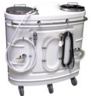
Mobile shower system