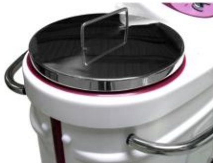
Fresh water tank