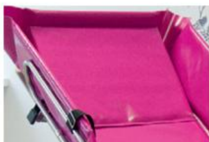
Waterproof mattress with high side