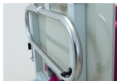
Lockable security side rails