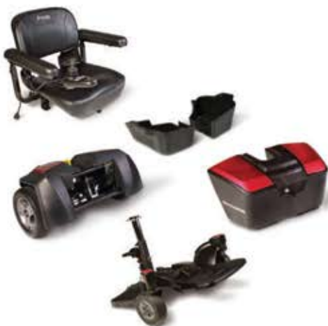
One-hand "Feather Touch" disassembly

The all-new Go Chair® is re-engineered from the ground up, offering a bold style available in an array of contemporary colours. Enhanced performance and comfort, along with feather-touch disassembly, allows you to enjoy lightweight travel and independence on the go. With an increased weight capacity of 136 kgs (300 lbs.) and a sleek, bold look, the Go Chair® makes travel easy.