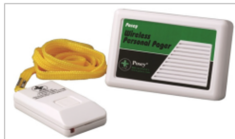
Fall Prevention Alarms