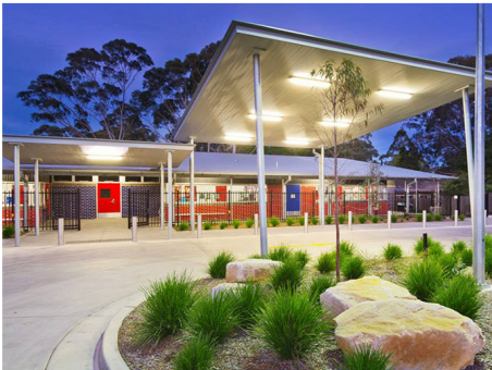
Overhead Hoist Systems