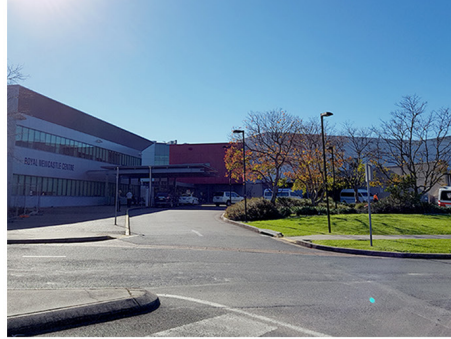
Overhead Hoist Systems

Royal North Shore Public Hospital Sydney NSW