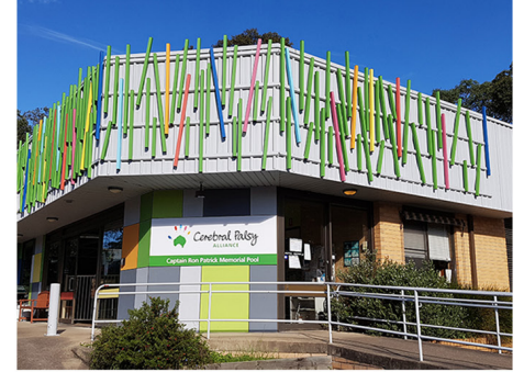
Overhead Hoist Systems for the Hydrotherapy Pool & Consultancy Rooms

John Hunter Public Hospital Newcastle NSW