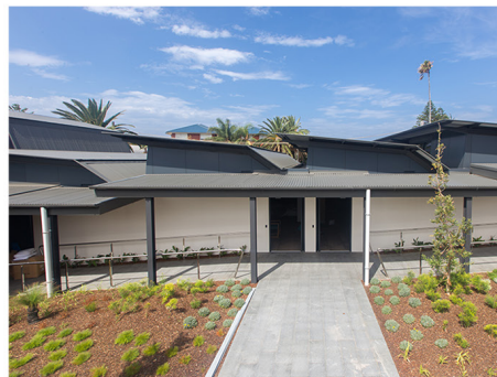
Overhead Hoist Systems and Hygiene Equipment

Changing Places - Triangle Park Penrith NSW