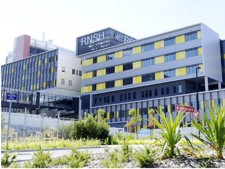
Overhead Hoist Systems

Royal North Shore Public Hospital Sydney NSW