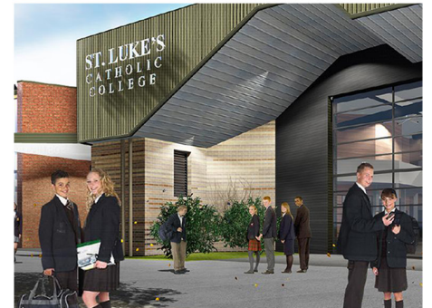
Overhead Hoist System & Hygiene Equipment

Lucas Garden Special School Canada Bay NSW