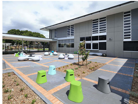
Overhead Hoist Systems & Hygiene Equipment

Lucas Garden Special School Canada Bay NSW