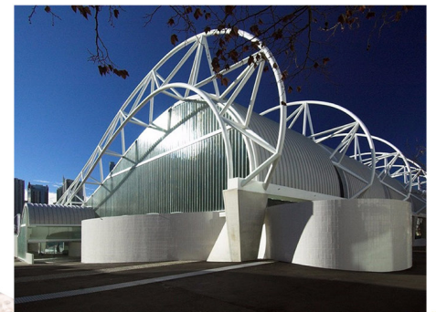
Overhead Hoist System for Accessible Bathroom