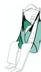
Suits loop slings