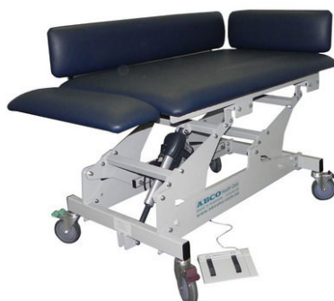
Leichhardt Junior Change Table