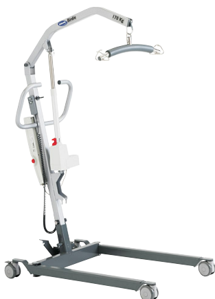
Birdie 150 Compact Lifting Hoist

The Birdie Compact is designed to be folded easily and without any tools or special skills required. The Birdie Compact takes up minimal space when stored and is easy to push and transport. When space is at a premium the Birdie Compact can even be stored upright.