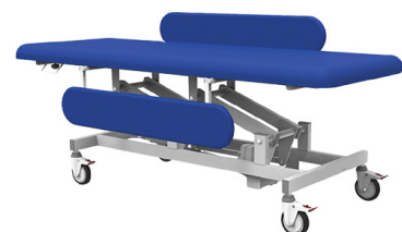
Kensington Adult Change Table