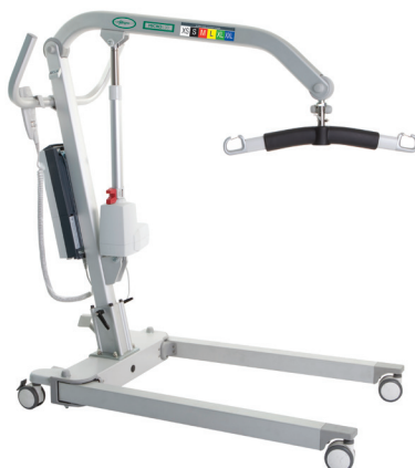
Allegro Micros Lifting Hoist