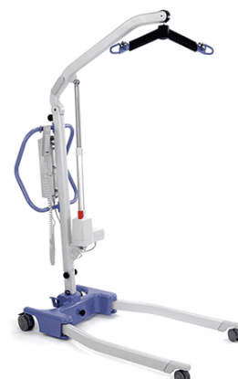
Oxford Advance Lifting Hoist